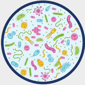
Collection of Probiotic Bacteria from a variety of sources

From Nature to ready to use effective, sustainable, and ecologic topical probiotics