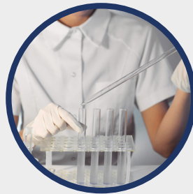
Mixing the CPB (Cocktail of Probiotic Bacteria) of different strains