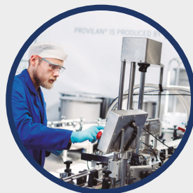
Formulated Probiotic ready to be mixed for different purposes