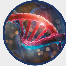
Identification of strains by analysing its genome