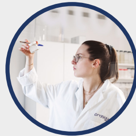
Strains are selected based on Safety, Pathogenicity, Efficiency & Stability